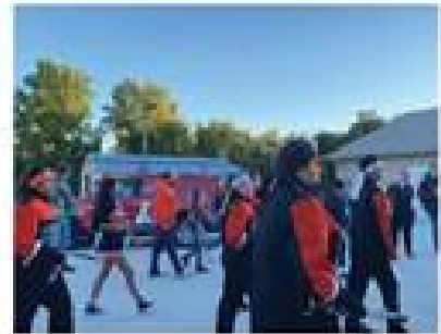
Ferrville Homecoming/Marching Band

From community parades to football tailgates, Talksooner's Wrapped Vehicle has been putting prevention on the map throughout LRE's 7-county footprint. Our bilingual wrapped design garners great attention about Talksooner.org and the many resources and talking tips available to parents/caregivers as they navigate these important conversations about youth substance use prevention.